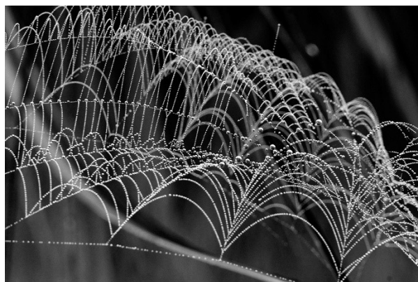
The 2022 Black & White Photography Best of Show was Cynthia Goldstein.