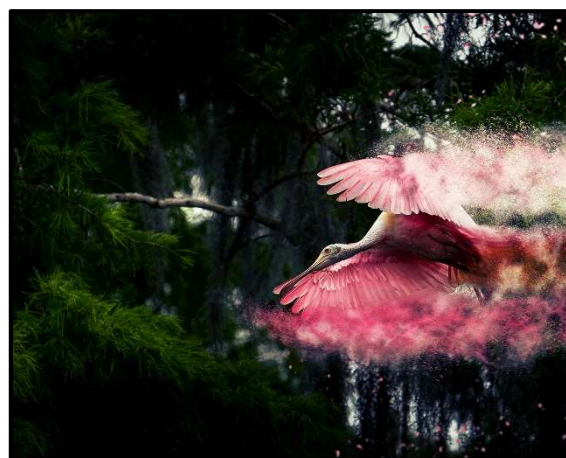
The 2022 Color Photography Best of Show was Chase Reed.

Email: brenda.gregory@floridastatefair.com